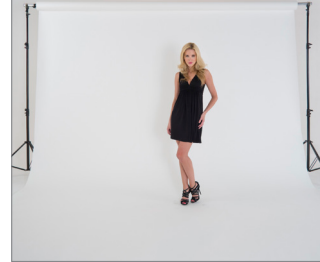
3m (10') LL LB1105