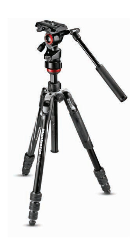
Befree Live Twist Aluminum Tripod + Befree Live Fluid Head