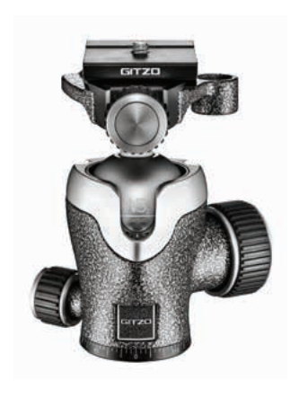
Series 1 Centre Ball head