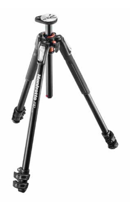
190XPRO Aluminum 3-Section Tripod