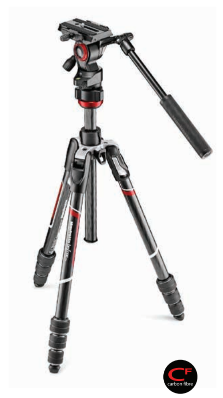
Befree Live Twist Carbon Fibre Tripod + Befree Live Fluid Head