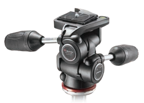
3 Way Tripod Head Mark II with Retractable Levers and 200PL Plate