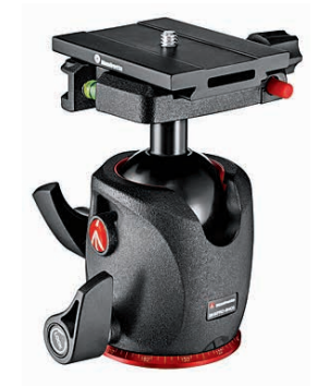
XPRO Magnesium Centre Ball Head with Q6PL Arca-style Plate