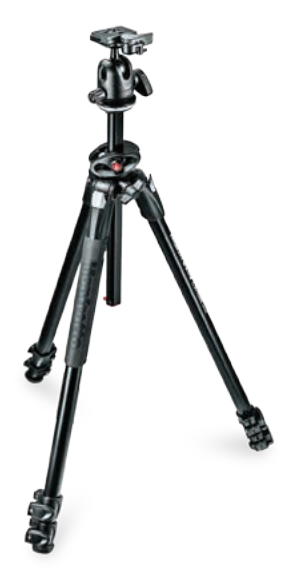
290 Dual Aluminum 3-Section Tripod + 496RC2 Ball Head