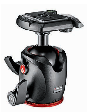
XPRO Magnesium Centre Ball Head with 200PL Plate