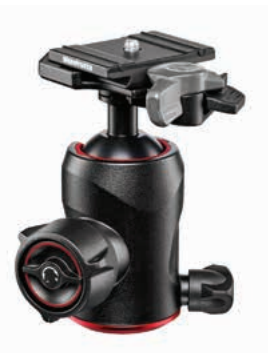
496 Compact Centre Ball Head with 200PL-PRO Plate