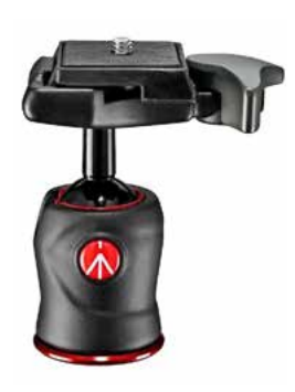
490 Mini Centre Ball Head with 200PL Plate