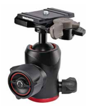
494 Mini Centre Ball Head with 200PL-PRO Plate