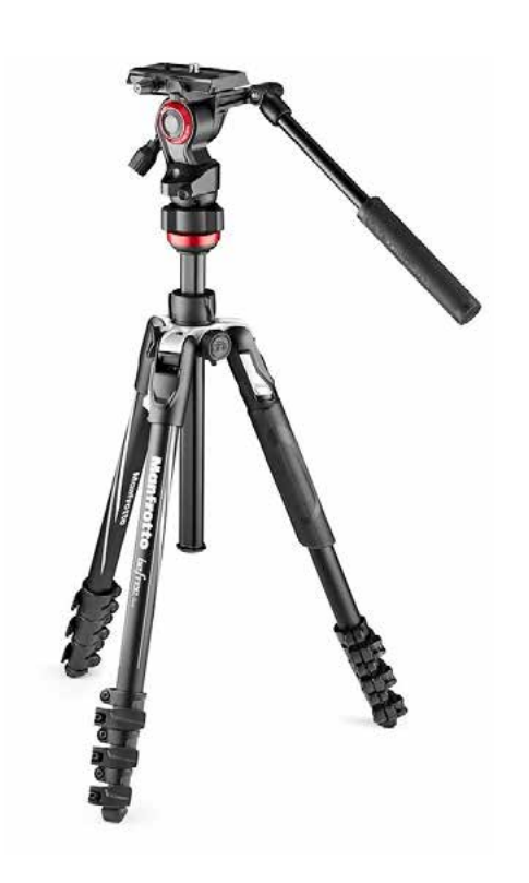
Befree Live Lever Aluminium Tripod + Video Head