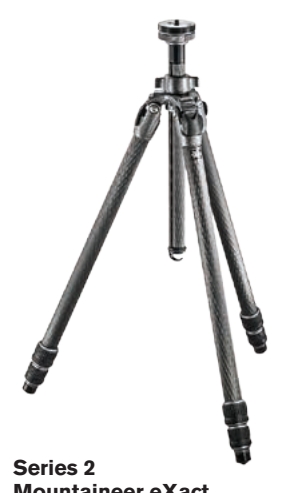
Series 2 Mountaineer eXact 3-Section Tripod