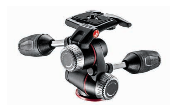
XPRO 3-Way Tripod Head with Counterbalance and Retractable Levers