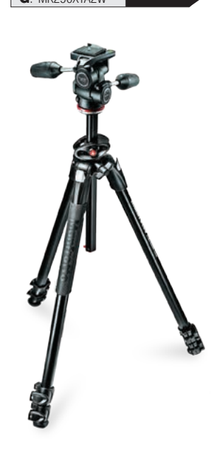
290 Dual Aluminum 3-Section Tripod + 804-3W 3-Way Head