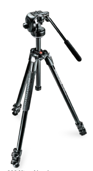
290 Xtra Aluminum 3-Section Tripod + 128RC Video Head