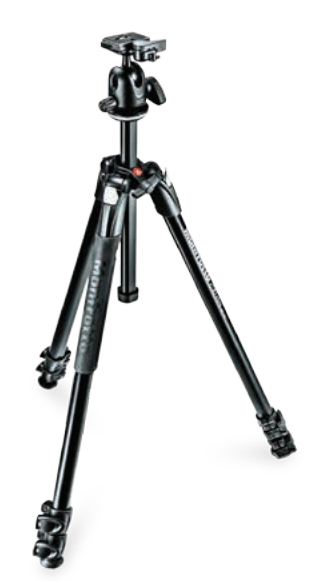
290 Xtra Aluminum 3-Section Tripod + 496RC2 Ball Head