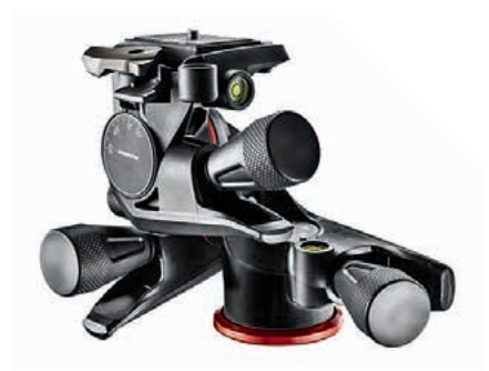
XPRO 3-way Geared Head with 200PL Plate