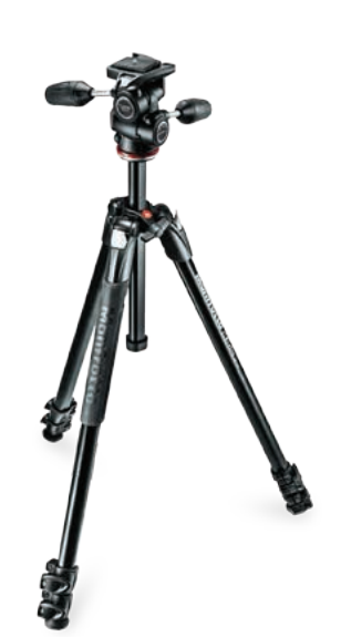
290 Xtra Aluminum 3-Section Tripod + 804-3W 3-Way Head