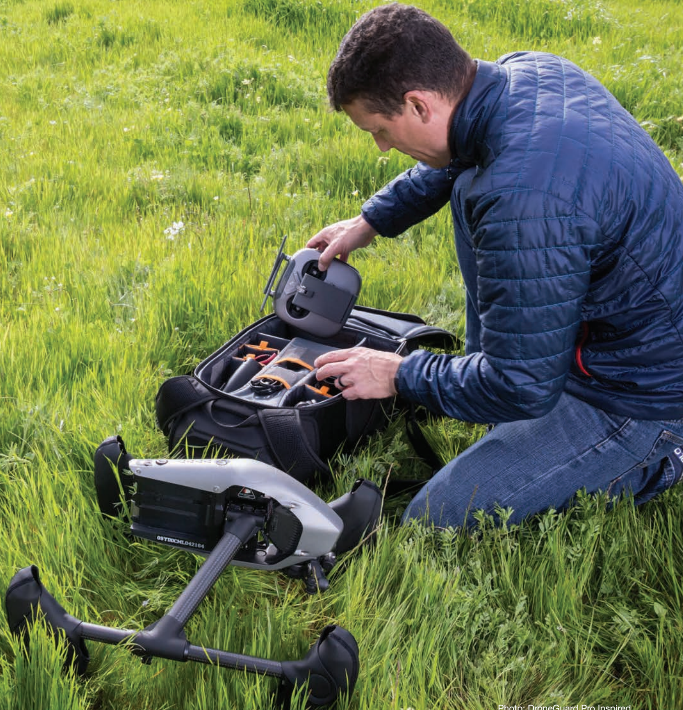
Photo: DroneGuard Pro Inspired Location: Petaluma, CA

Carry and protect aerial photography and quad racing equipment