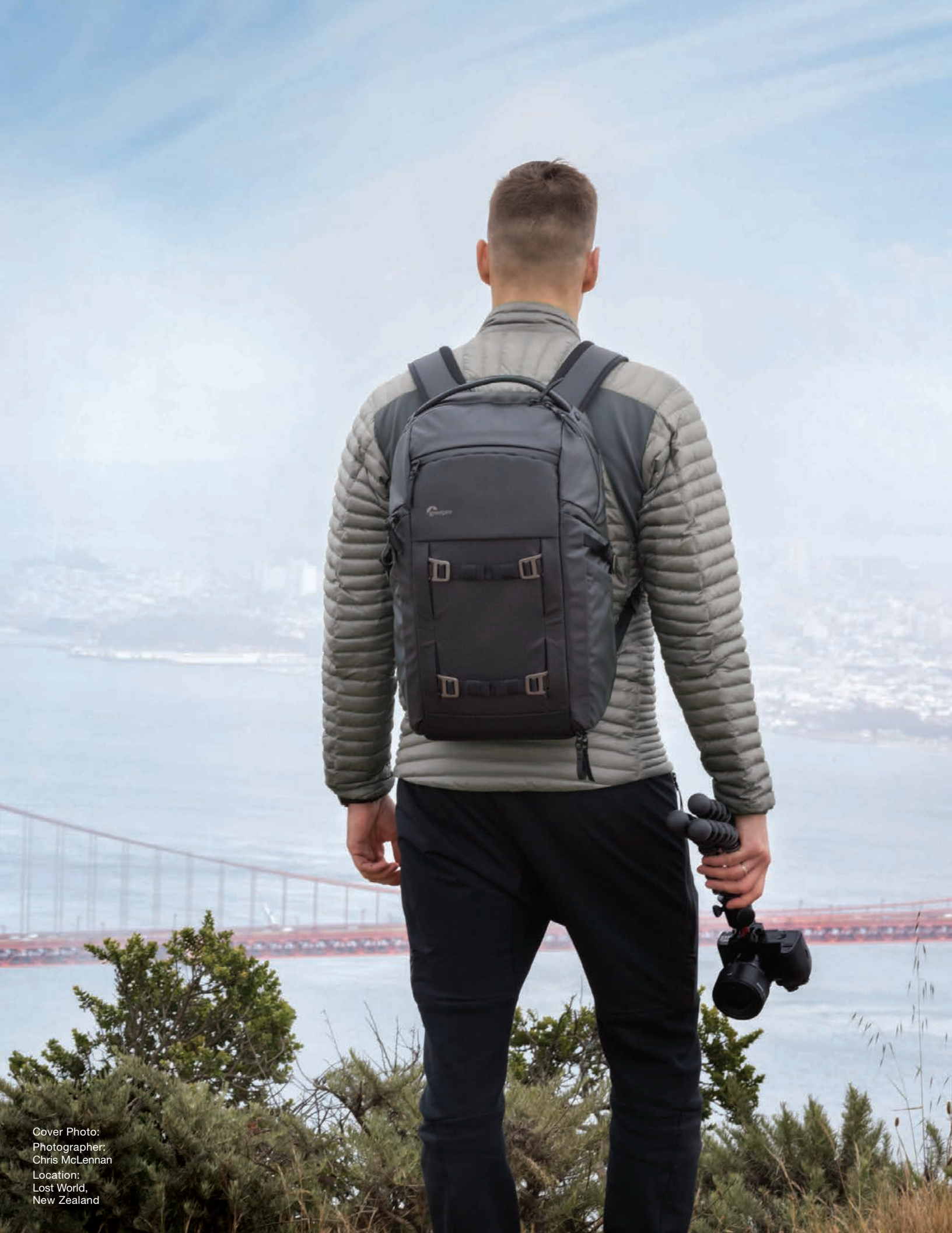
Cover Photo: Photographer: Chris McLennan Location: Lost World, New Zealand