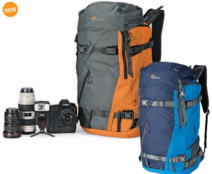
Photo: Powder BP 500 AW Location: Mont Blanc, Italy